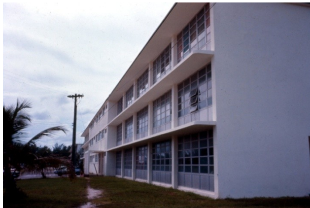
Key West Barracks

which was a refresher from high school physics classes.) We even got to make light bulbs light up and buzzers sound with batteries, wires, etc.