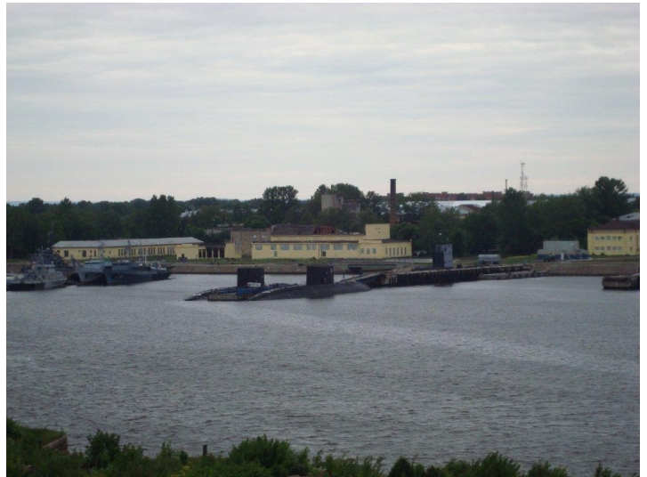
Kilo Class Submarines in St. Petersburg, Russia

Simpson (FFG-56) in the port of Tallinn, Estonia; and seeing three Russian submarines in St. Petersburg -- two of which were KILOs being exported to Vietnam.