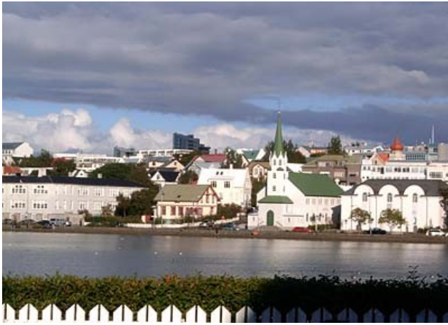
Frikirkjan, Reykjavik, Iceland

Now that I am fully retired, we live in The Villages in Florida. We have traveled to Iceland every year since our marriage and spend about three months at a time here, enjoying nature and our family. Life has been good and although I enjoyed the work and the people I have met and the adventures that I survived, life is family and we have been a family.