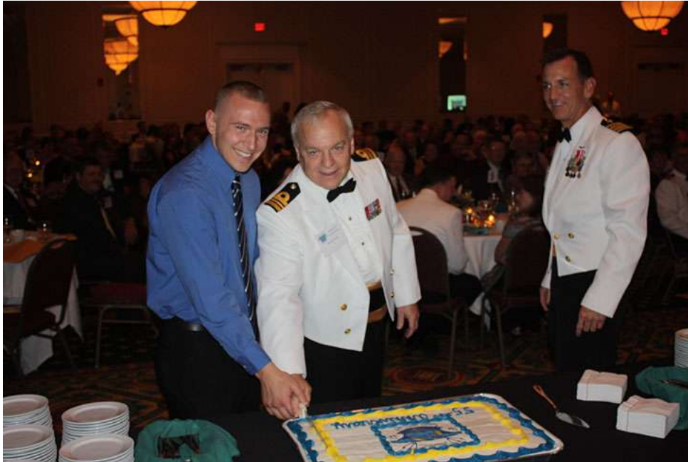
Oldest and youngest Active Duty Sailors perform cake cutting duties at IUSS 55th Anniversary

The Integrated Undersea Surveillance System (IUSS) held its 55 th Anniversary Reunion, sponsored by the IUSS-CAESAR Alumni Association, the weekend of September 11-13, 2009 in Norfolk, VA. The event-filled weekend kicked off with a golf tournament Friday morning at Little Creek Amphibious Base, and continued that evening with a “meet and greet” held at the beautiful Norfolk Waterside Marriott. Lots of laughs and many “sea/shore stories” were heard during the course of the evening over hors d’oeuvres and a few (quite a few, in some cases) cocktails! Hotel staff closed the Piano Bar at 0300, much to the dismay of quite a number of revelers!