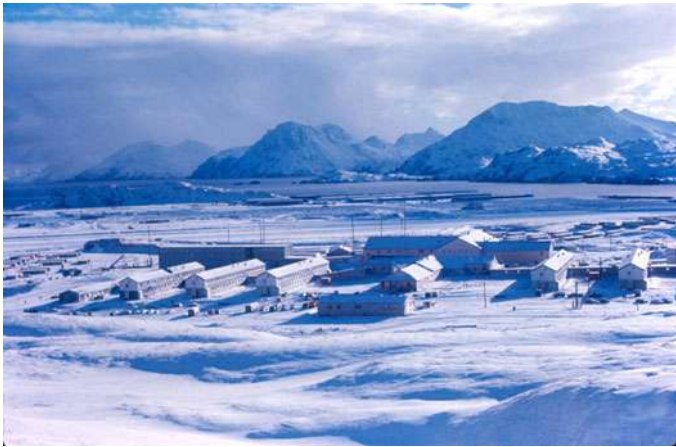
NavFac Adak -- OT barracks on left

Another day John Dempsey? and I were taking core samples on the hill behind the barracks. We were in a round, flat area about 30 feet in diameter that looked like a former lake bed. We started taking a core sample and got an inch or two of sediment when the rod dropped down about 2 feet. We screwed on the next section and got a little more before it dropped again. With the third rod on we ended up with less than 9 inches of dirt after pushing the rod down 9 feet! We both looked at each other and rapidly moved away from the area! We never did go back with a shovel to see what we were (or weren't) standing on! (Caution: It is a bad idea to randomly dig holes on Adak due to possible unexploded ordinance from WWII!)