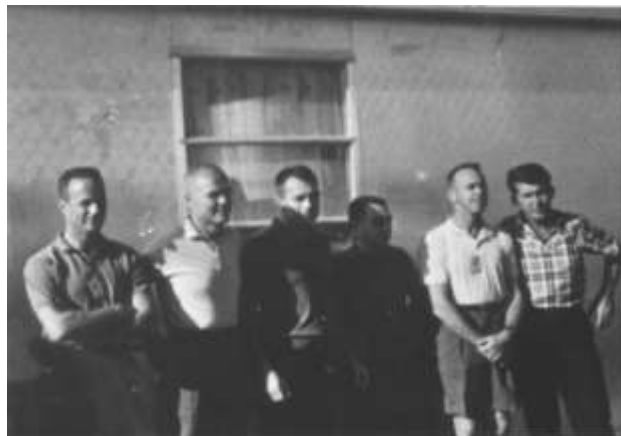
Our first six astronauts: Carpenter, Glenn, Cooper, Grissom, Sheppard, and Schirra