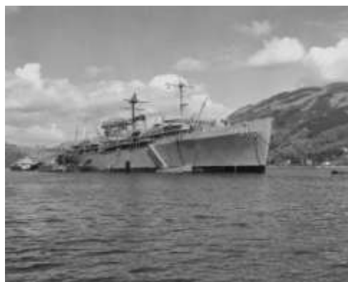
USS Hunley AS-31

I made a drawing of its silhouette and headed back for "Jane's"... It turned out to be the USS Hunley AS-31. Later that day we had high ranking visitors who proceeded for the next 3 or 4 days to survey the island and our facilities. Their intent was to use San Sal as a staging area (tent city) to house troops that may be called upon, and for use as a possible medical facility.