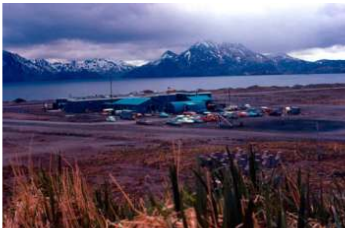
Naval Facility Adak