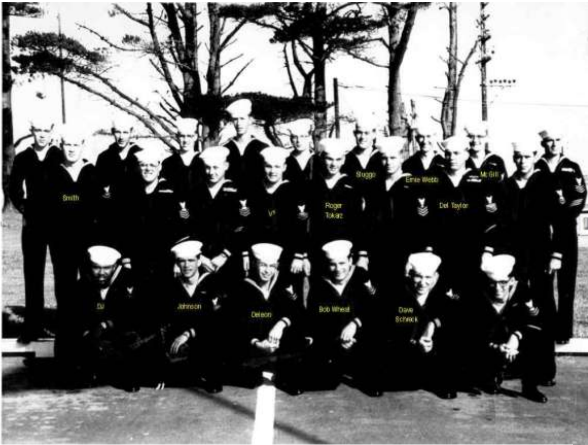
Centerville Beach Operations Department 1959 (minus watchstanders)

Next was to try to stabilize the hillside. In hindsight it did not look too smart to bulldoze smooth and vegetation-free the rough cliffside where the cables ran up to the TEB from the sea. New erosion gullies were formed and growing; the whole hillside looked ready to slide into the Pacific. The fix decided on was to plug the forming gullies with hay bales and to plant the raw clay with iceplants, which seemed to be nature's way of protecting the hillsides on either side of the cable run. Thus it was that I spent three days along with the rest of the station's people in the mud and rain manhandling hay bales down the slope and planting iceplants across the entire swath of the 420' cable run. Dawn to dusk and miserable. But it worked. The hillside was fixed and cable was stable.